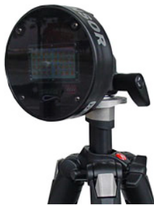
Radar Sensor Speedmaster